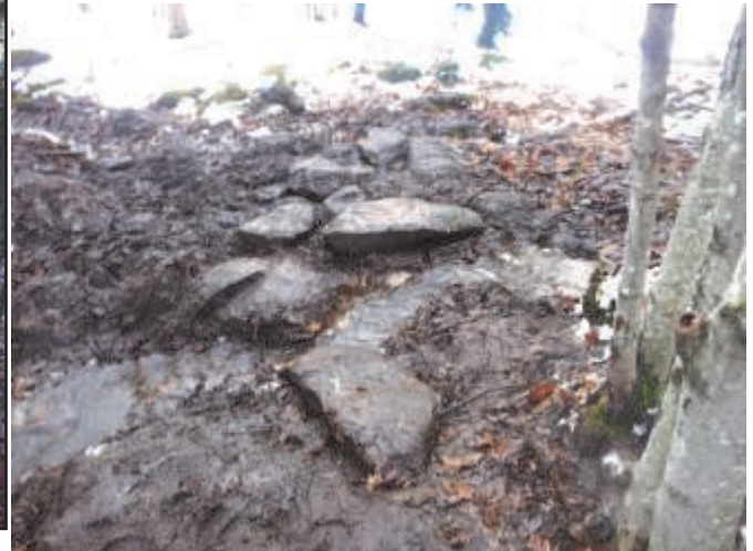
Figure 2: Shows where the stepping stones cross the small creek along the Round Top Trail. Hikers will now be able to navigate the trail section without stepping in water and mud.