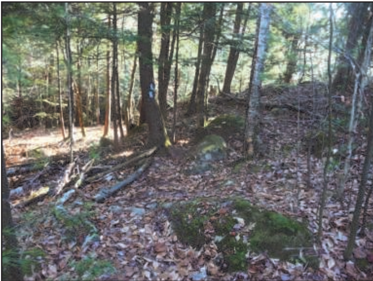
Figure 1: Shows a blaze indicating a right turn on the trail. Scouts learned how blazes are used to show directions on trail systems.

Collectively, the two days were a great help for the BRCA. Having volunteer groups like the Boy Scouts is what allows the BRCA to make a big impact. By mobilizing local volunteers to come out and support our efforts we can greatly improve local conservation properties that the public can in turn enjoy as the recreation assets they provide. These conservation properties are purchased and maintained for the public's recreational use. As a user we hope that you understand that most of the work done on these properties is by volunteers like yourself. Join the BRCA or other organization that participates in similar activity's to help give back to the lands and trail systems that you enjoy.